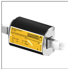
AT-2204 ATLAN 1000BASE-T POE