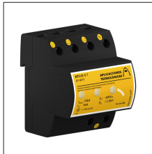
AT-8217 ATSUB-D T