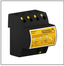
AT-8217 ATSUB-D T